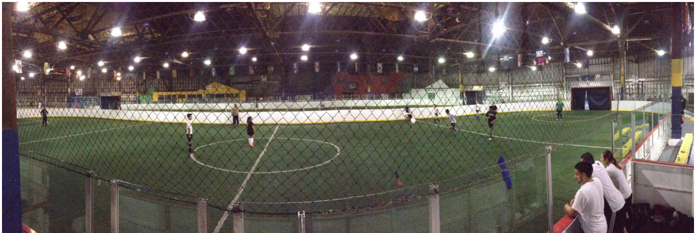
Indoor soccer leagues are one of many uses at the Mare Island Sports Center.

The Sports Center is open to the public from 3 p.m. to 10 p.m. Monday through Friday, and 9 a.m. to 10 p.m. on weekends. More information on GVRD and the Sports Center is available at www.gvrd.org , and they can be contacted at (707) 562-4625.