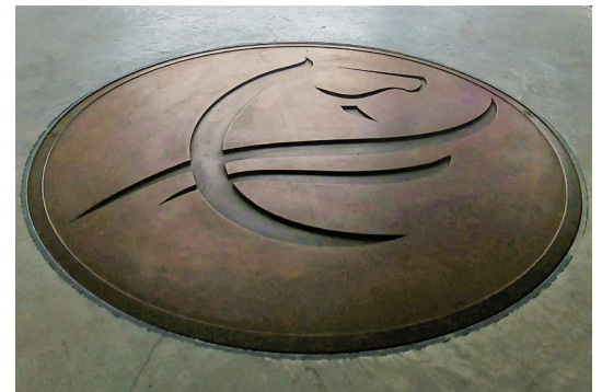
A manhole cover for the Mare Island Coal Sheds was specially designed and built by the experts at Meta Design & Manufacturing Inc.

More information about Meta can be found at metadesignmfg.com and they can be reached at 1-888-817-7018.